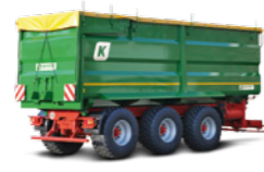
MUK 402 (31-34 t total weight)