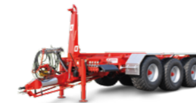
THL 30 (31-34 t total weight, 30 t lifting capacity)