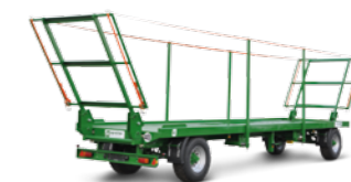
PWO 18 (18 t total weight)