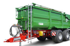
MUK 303 (20-24 t total weight)