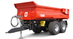
MUP 20 SP (22-24 t total weight)