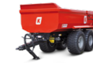
MUP 20 VG (22-24 t total weight)