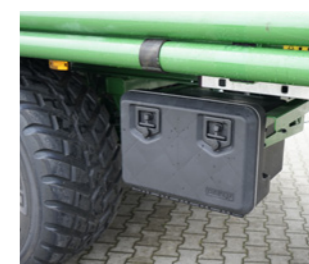
The tool box The sturdy plastic box provides you with protected storage space for tools, lashing straps, and other equipment.