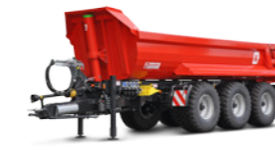
MUP 30 HP (31-34 t total weight)