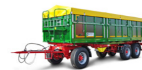
HKD 402 (24 t total weight)