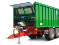
TAW 20-K (20-24 t total weight)