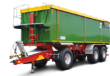
TMR 34 (34 t total weight)