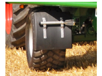
The plastic mudguards