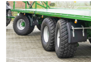
The positive steering axle The turning radius and therefore also the manoeuvrability of the trailer are effectively improved on the three-axle vehicle by adding a positive steering axle on the last axle. The steering third axle will help preserve tyres and the floor. As the steering is activated automatically via the turntable on the front axle, no separate coupling to the tractor unit is required.