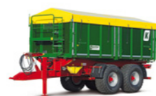
TKD 302 (20-24 t total weight)