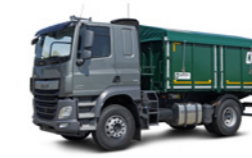
ZKA 1 (16 t total weight)