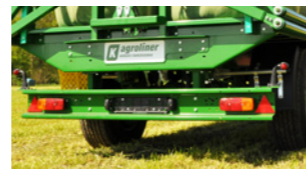
The underride protection Lights and number plate are protected and integrated into the underride protection.

Best quality. And that across the range.