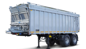
SAW 32 (32 t total weight)