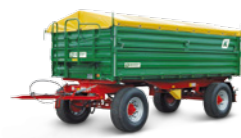
HKD 200 (14 t total weight)