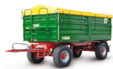
HKD 290 (18 t total weight)