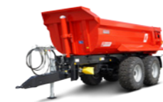
MUP 20 HP (20-24 t total weight)