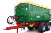
TKD 302-S (20-24 t total weight)