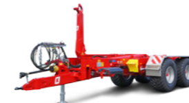
THL 20 (20-24 t total weight, 17-21 t lifting capacity)