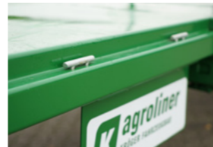
The lashing points Retractable lashing points are positioned in the outer frame profile at 500 mm.