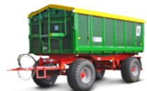
HKD 302-S (18 t total weight)