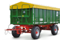
HKD 302 (18 t total weight)