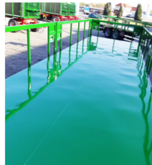
The floor assembly The loading platform is made of a solid 4 mm steel floor.

Efficient transport logistics is becoming increasingly important in agriculture. With our range of platform trailers, we offer tried-and-tested solutions for transporting virtually all general cargo that is used in agriculture, such as potato crates, vegetable boxes, round or rectangular bales, pallet cages, or pallet goods. The modular system means that the trailer can be configured individually for the respective transport tasks.